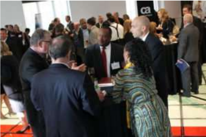
During Networking Break